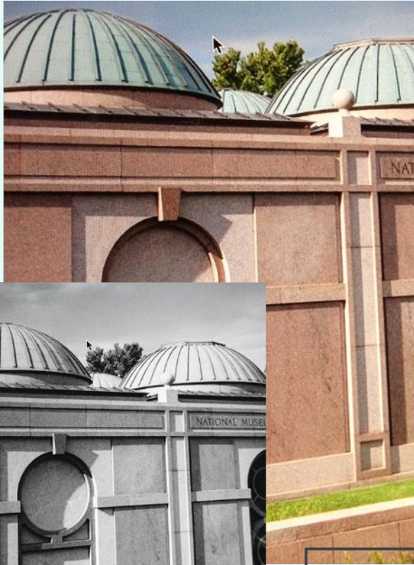
PHOTOGRAPH OF THE BUILDING